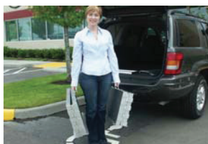
Separates for transport and storage