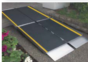
Bottom transition plates adjust to uneven terrain