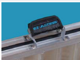
Ergonomically designed handles offer convenient carrying and a comfortable grip